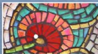
Mosaics: Thursday September 8-October 13, 2022 from 1:00-2:30 pm (in person - TBD)

Contact mel@larchelondon.org to Register