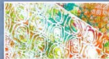
Printmaking: Thursday February 2 - March 9, 2023 from 1:00-2:30 pm (online)