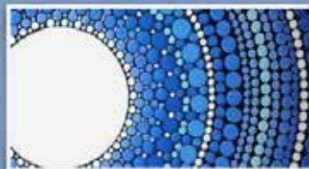
Dot Art: Thursday November 10 - December 15, 2022 from 1:00-2:30 pm (online)